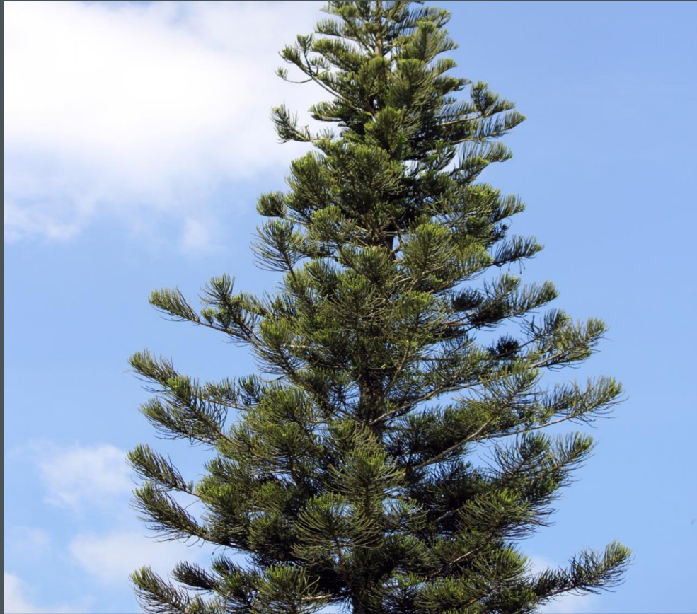
1,800 Ponderosa Pine Trees