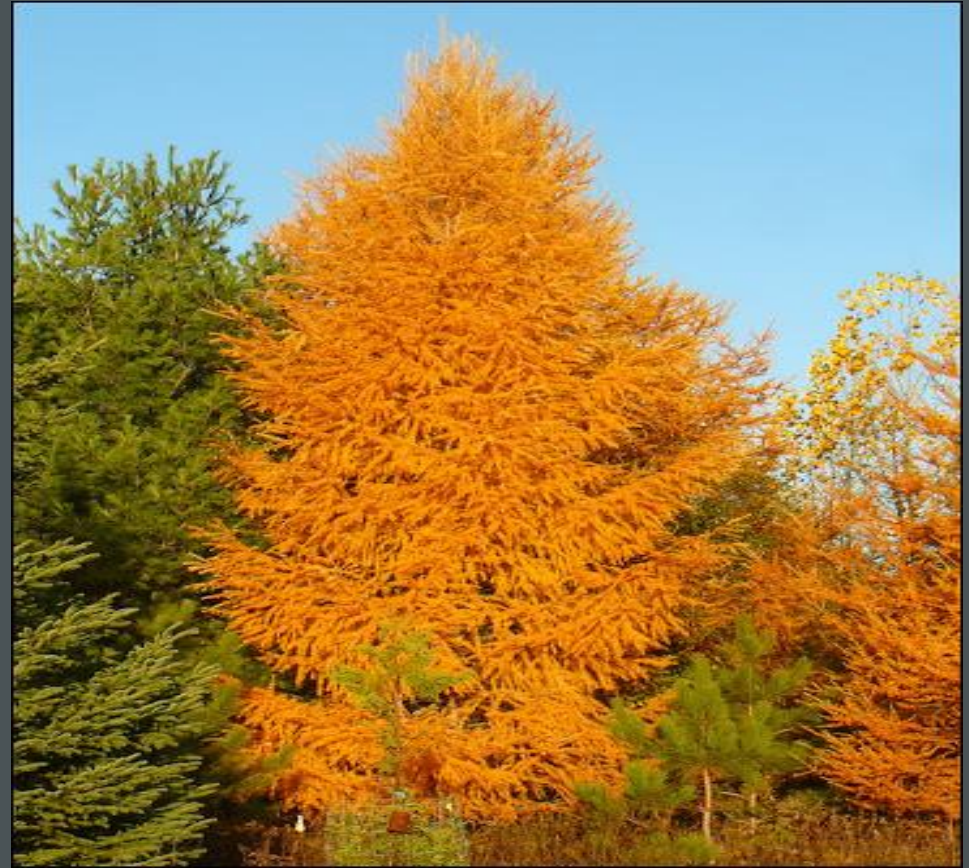
20 Tamarack Trees