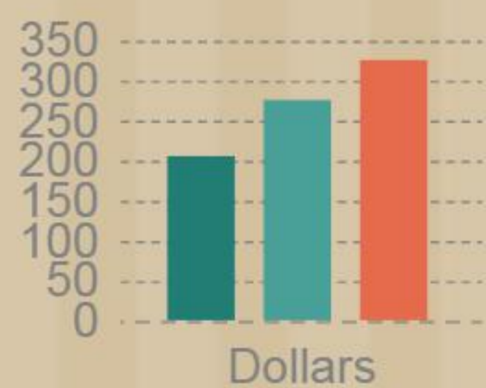
'15 '16 '17