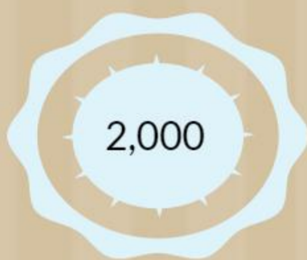
Leadership Training Hours